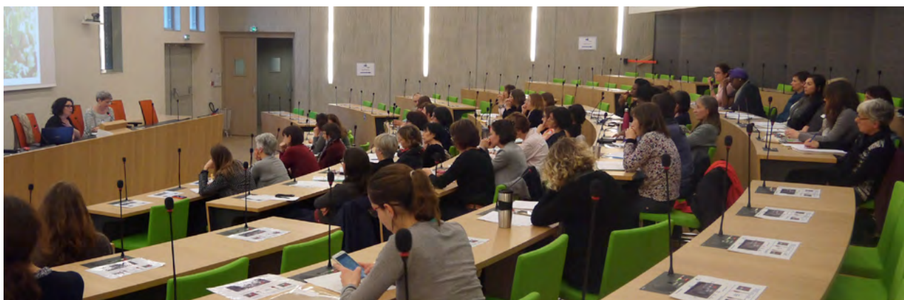
Les animateur-trice-s santé-environnement réuni.e.s pour les journées de suivi, Annemasse, mars 2018