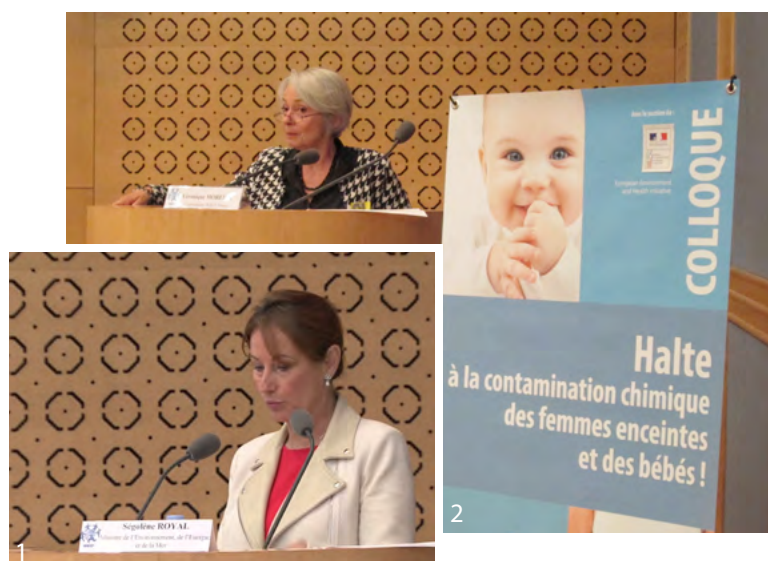
Ouverture du colloque Halte à la contamination chimique des femmes enceintes et des bébés ! par la ministre de l'écologie Ségolène Royal (1), et intervention de Véronique Moreira (2), présidente de WECF France, Paris, juin 2016