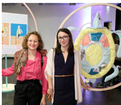
Les lauréates des 1er Prix et 2ème Prix du concours Design-moi un jouet , avec des membres du jury, lors de la remise des Prix et l'exposition des projets, Paris, novembre 2017