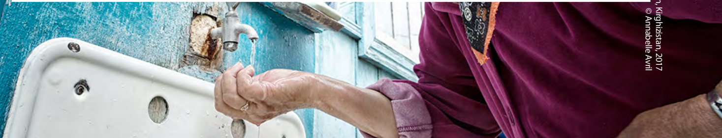
Accès à l'eau potable dans le village de An-Oston, Kirghizistan, 2017