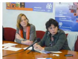
Conférence de presse au Parlement européen, Bruxelles, 2012