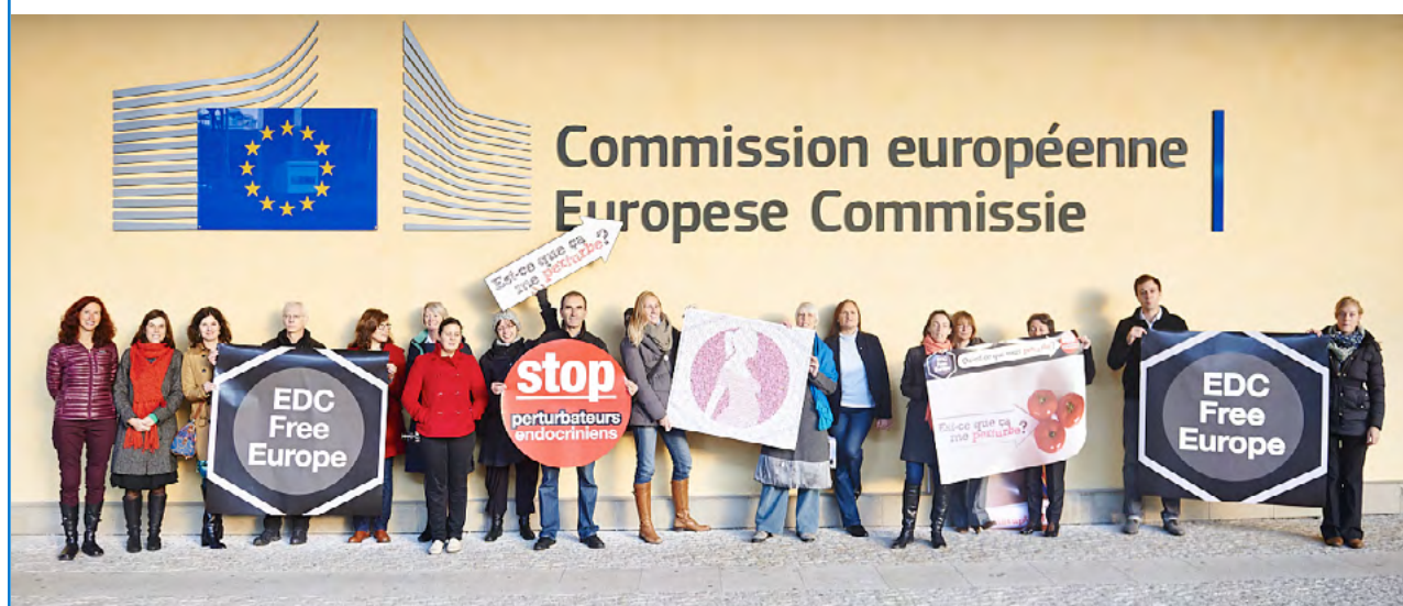
Membres de la coalition EDC-Free Europe lors d'une action devant la Commission européenne, Bruxelles, novembre 2013