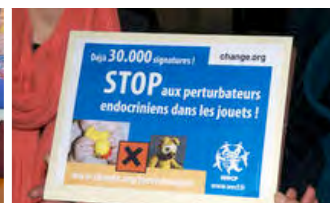
Remise aux ministères de la santé et de l'écologie de la pétition Stop aux perturbateurs endocriniens dans les jouets , Paris, 2014