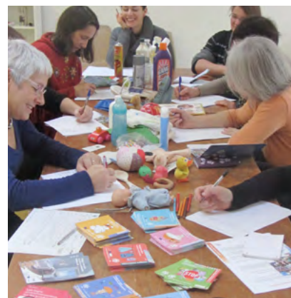
Atelier Nesting à Frangy (74) en 2013