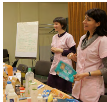
Un atelier Nesting organisé par des sages-femmes de la clinique Belledonne (38), en 2014

In 2017, WECF France is missioned for a survey on "perinatal period and health", together with Artemis network, for the foundation Avenir of the Mutuelle familiale.