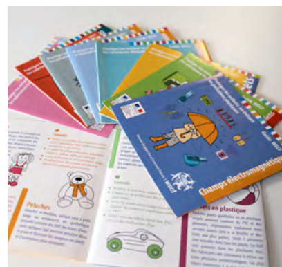
Les guides d'information Nesting