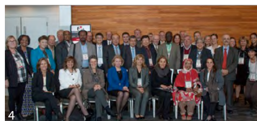
(3) Intervenant.e.s lors des tables-rondes du colloque Cancer du sein et environnement lors du Ruban de l'Espoir, Lyon, octobre 2014