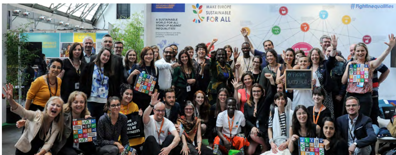
Partenaires du projet « Construire une Europe durable pour toutes et tous lors des Journées européennes du Développement, Bruxelles, Juin 2018

Since SDGs were officially announced in 2015, WECF France endeavours to implement the 2030 agenda through various activities: