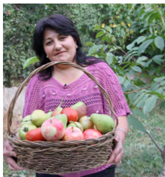
Agricultrice arménienne lors d'une visite d'échanges, Arménie, 2014