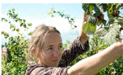
Agricultrice membre du réseau Femmes rurales, Haute-Savoie, 2013