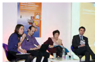
Colloque « Jouets et substances chimiques préoccupantes », Paris, 2010